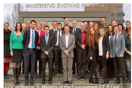
CCIC in Prague