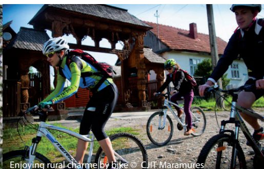
Enjoying rural charm by bike