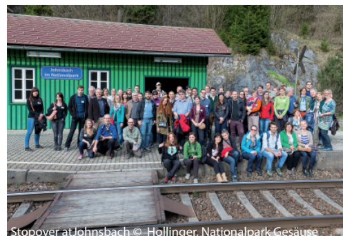
Stopover at Johnsbach

The pilot region “Alpenregion National Park Gesäuse”, which was the venue of the Final Conference, comprises parts of the Gesäuse National Park and the Eisenwurzen Nature Park in Styria, Austria. In local tourism, the focal points vary from adventure sports on the Salza River, mountaineering in the Gesäuse Mountains to cultural tourism in Admont. Over the years, however, cutbacks in services have led to a growing number of people using their car to explore the region. GSEISPUR, an integrated mobility platform in the Gesäuse National Park, offers flexible mobility for outdoor tourism, both for locals and visitors, from May to October. Since its launch in 2013, GSEISPUR has been offering a shuttle bus service to/from the main railway station, a door-to-door taxi service and an e-scooter rental service, supported by a website and a smart phone app. Despite the initial lack of web and marketing support, 1638 passengers took advantage of the shuttle from June to October 2013, averaging nearly 3.5 passengers per trip. The National Park also has long-term plans to develop a year-round flexible transport system in cooperation with local municipalities.