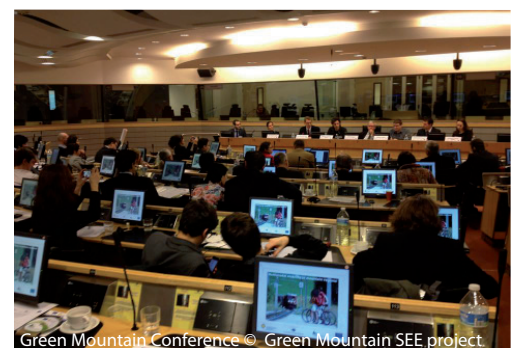
Green Mountain Conference