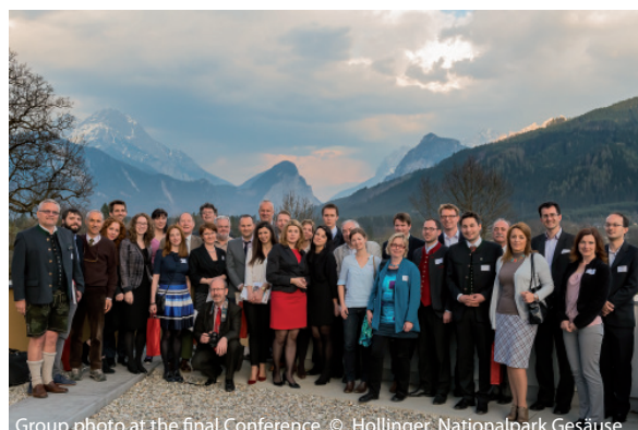
Group photo at the final Conference

...and many more studies, events, photos and links!