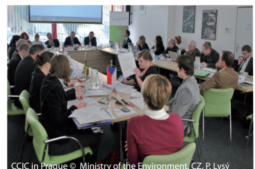
CCIC in Prague

During the Final Conference of the ACCESS2MOUNTAIN Project, the UNEP Vienna-ISCC's representative presented the contents of the Protocol and explained the process behind the draft and its finalisation. In this context, the importance of the ACCESS2MOUNTAIN Project was stressed, in that it supported the Carpathian Convention Transport Working Group Meetings technically and financially, and provided important inputs to the text of the Protocol by virtue of its partnership status. The Protocol, if adopted and signed at COP4, will be another strategic point of reference for the development of sustainable transport projects and activities in the Carpathians.