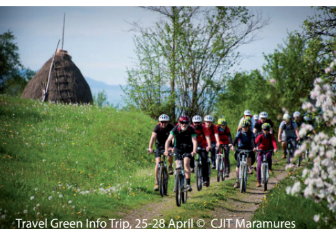
Travel Green Info Trip, 25-28 April