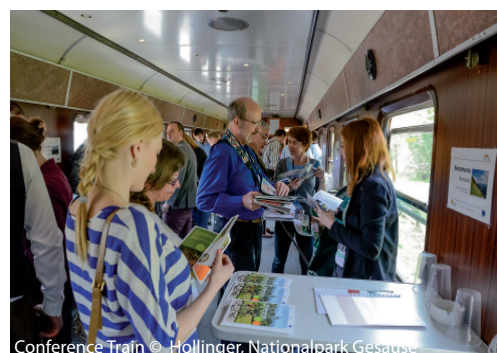
Conference Train